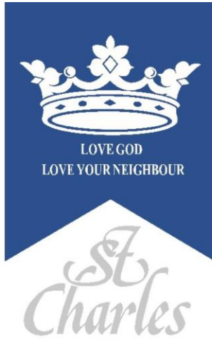
St Charles Catholic Primary School Love God, Love Thy Neighbour