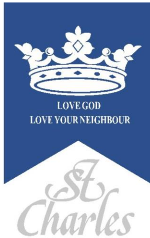
St Charles Catholic Primary School Love God, Love Thy Neighbour